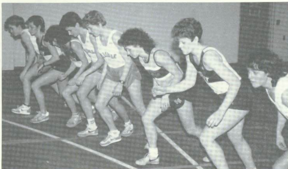
Siena's track team during a relay event.